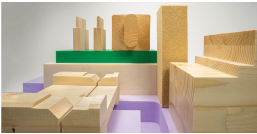
The HeliCut-System with tear-free machining results in different materials and various machining processes.

For many types of processing in wood and plastic, not only the quality but also the machining direction and the chip removal often play an important role. Conventional tools offer the basic conditions, but are not always very user-friendly and rarely achieve the desired machining results.