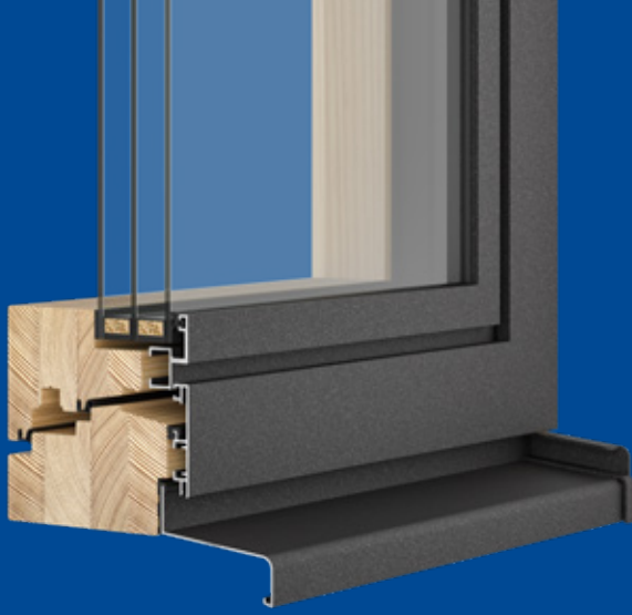
ClimaTrend Style wood/aluminium window with Gutmann CTS