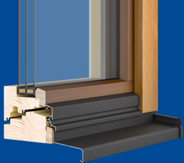
ClimaTrend Style wooden window with Gutmann CTS